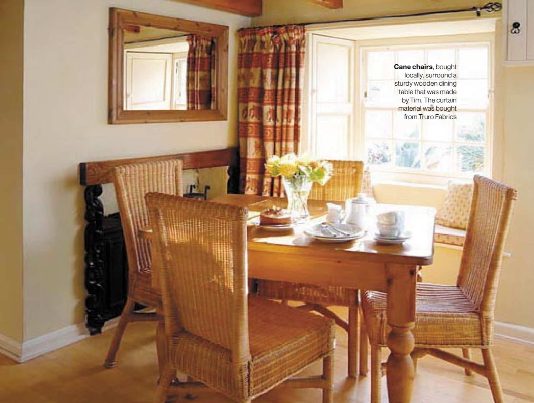
Cane chairs , bought locally, surround a sturdy wooden dining table that was made by Tim. The curtain material was bought from Truro Fabrics